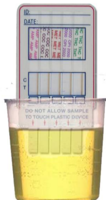
Dip into urine sample for 10 seconds